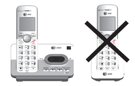
For registration, put the handset on the telephone base, not the handset charger.

If the registration fails, the handset displays Failed and then To register HS... and ... see manual , alternately. Try the registration again by removing the handset from the telephone base and then placing it back in.